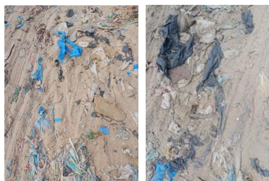
Figure 2. Demonstrates the transformation of the environment from a pristine and well-maintained state to a degraded and unappealing condition due to the disposal of disregarded single-use plastic sheets mixed with sand on the streets. @ two photos taken from neighborhood street in Somalia.

As these plastic sheets interact with the soil, they may undergo physical alterations, breaking down into smaller particles over time. These micro plastics can pose a threat to soil health, affecting its composition and potentially leading to long-term ecological consequences.