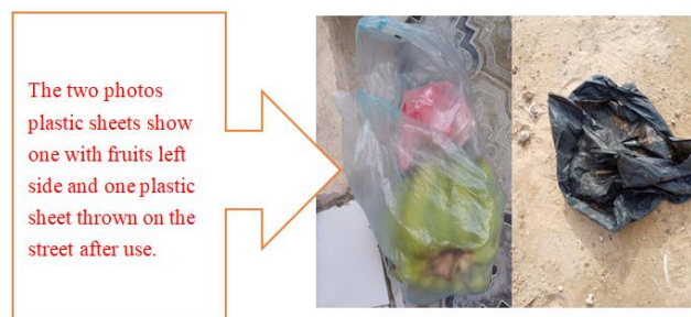
Figure 1. Depicts the process wherein individuals acquire essential items from the market using single-use plastic bags and subsequently discard them on the streets once they are no longer needed.

ence of incineration systems within any of the healthcare facilities.