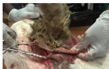
Figure 4. Illustrates the scenario where animals consume plastic sheets, mistakenly perceiving them as grass, leading to illness when the undigested plastic substances cause bending in the stomach and small intestines. The image originated from a Saab TV broadcast reporting on a surgical procedure for a female goat that had ingested a plastic sheet and became unwell at a university in Hargeisa, Somalia. https://www.facebook.com/saabtv/videos/800544966813004 .

Discarded plastic becomes a hazard for wildlife as animals, often mistaking it for food, ingest these materials. The ingestion of plastic by animals can lead to severe consequences, particularly in the case of marine life and terrestrial species. The plastic elements, once consumed, can cause damage to the small intestines of these animals, leading to complications such as blockages, internal injuries, and, in many cases, fatalities.